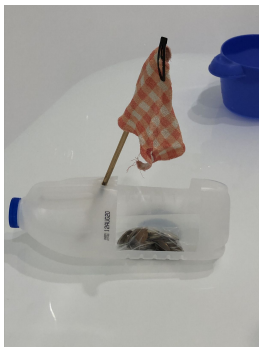
Gemma L: 1/2 LY, make a raft challenge.