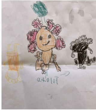
Alek's axolotl drawing: Foundation ZF

Elegant spiders weaving webs Lines of soldier ants Carrying eggs wiggly, wriggly worms And busy buzzy bees Butterflies fluttering Through the trees Praying mantises Pigeons in nests visit your garden-