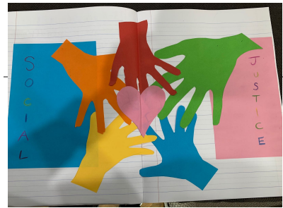
Social Justice Poster: Rafael P

Covid, Covid please wash away and never come back to the bay Loved ones are in danger and we need to work together and stop this hazard. We can't fight this no more, Blow up the world and give us a fresh start, just stop this madness. Please covid just go, go as far as you can and never come back, just please leave the world as fast as you can. Sophie D 3/4FD