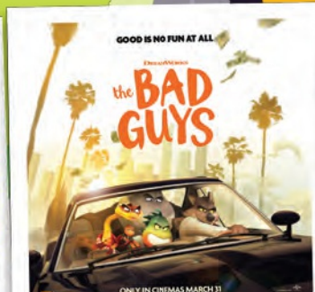
Off to the Movies!