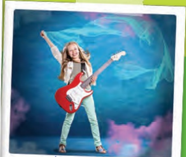
TheirCare's Got Talent