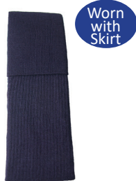
Socks Knee High Navy