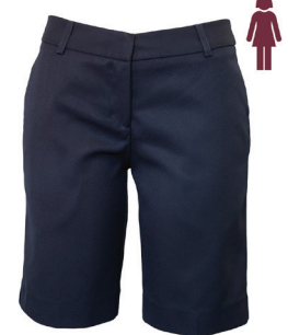
Shorts Tailored Navy