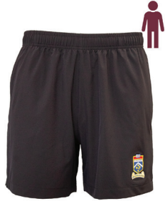
Sport Shorts Unisex