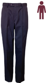
Trousers pleated Navy