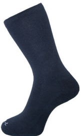
Socks Navy Crew 3 pkt