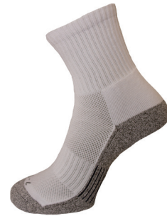
Sport Socks 2 pkt