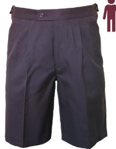
Shorts Pleated Navy