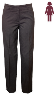
Pants Tailored Navy