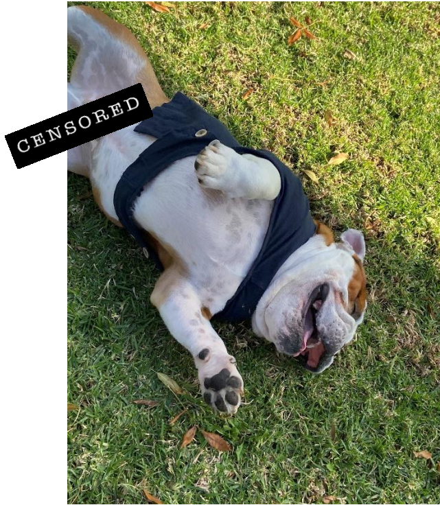
It's a Success!