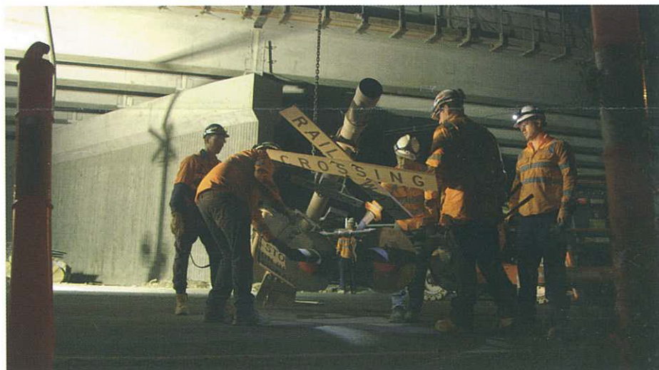
Workers dismantling the Melton Highway boom gates

The team has now turned its attention to the northern section of the bridge and preparing the connection between Sydenham and Victoria roads under the bridge.