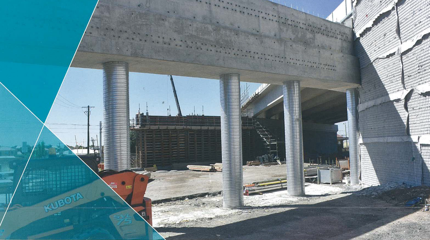
The foundations of the northern bridge