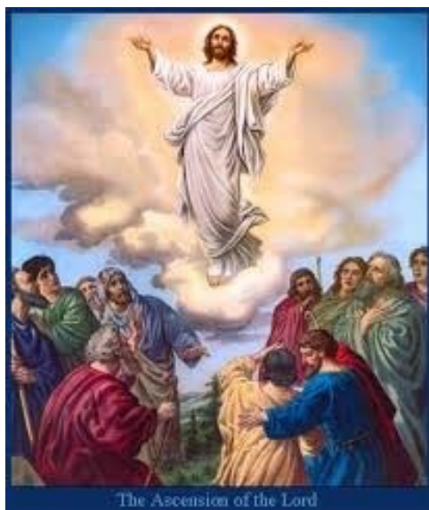
The Ascension of the Lord

ST VINCENT DE PAUL ASSISTANCE Free Call 1800 305 330