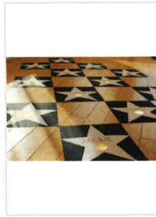
Make your own Hollywood Walk of Fame Star!