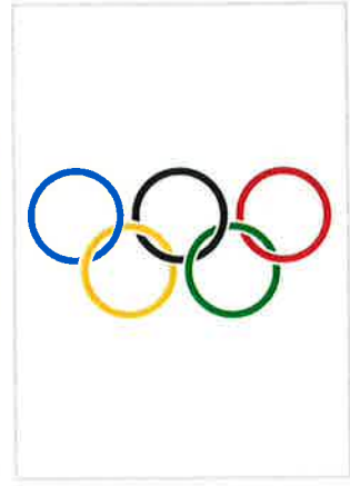
Take part in our Avegates Mini-Olympics