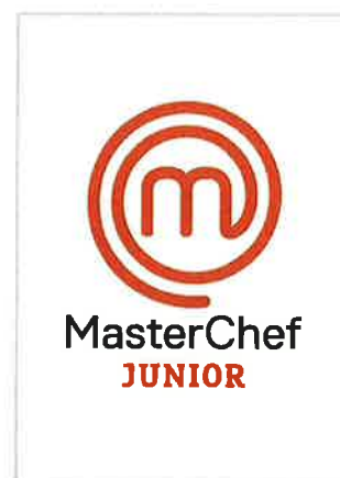
Junior Masterchef cooking day