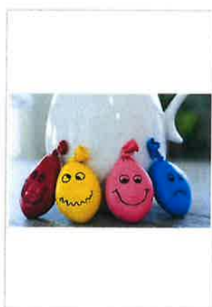
Wacky Squeeze Balls