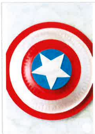
Make your own Captain America Shield