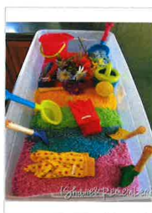
Sensory Rainbow Rice