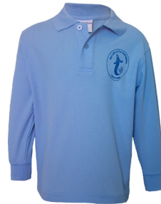
Polo Top Long Sleeve