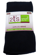
Tights Cotton Navy