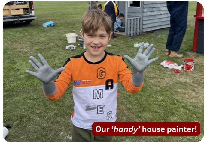
Our 'handy' house painter!