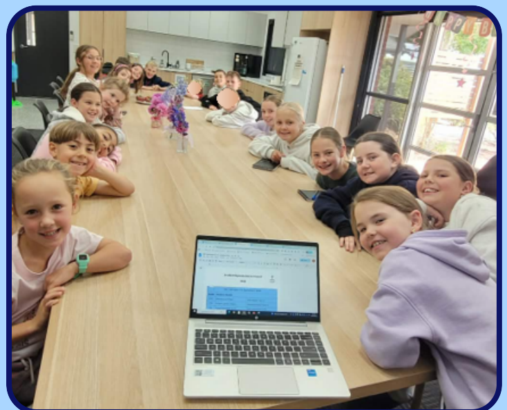
Our SRC reps at their first meeting!

The SRC has already had a huge impact in our school. We look forward to working with these incredible leaders as the term progresses.