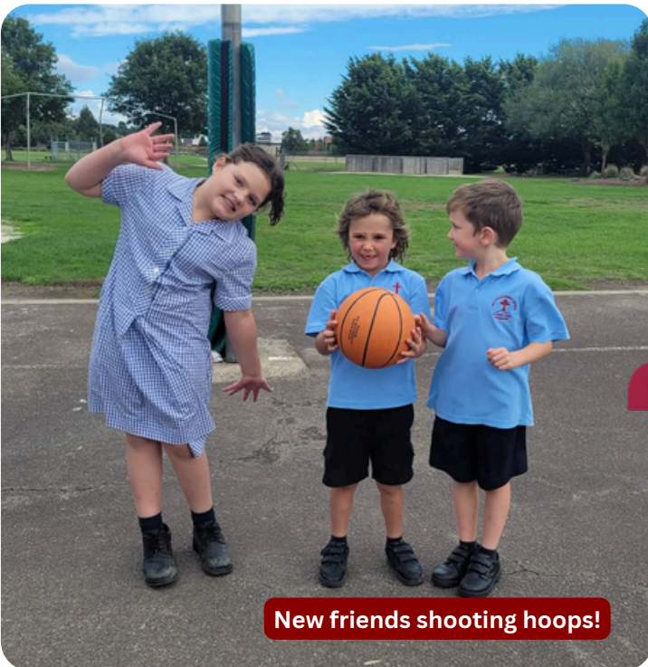
New friends shooting hoops!