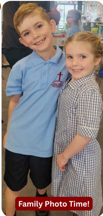
Family Photo Time!