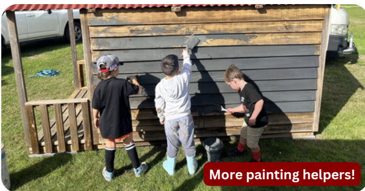
More painting helpers!