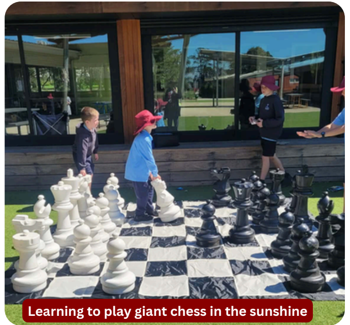
Learning to play giant chess in the sunshine