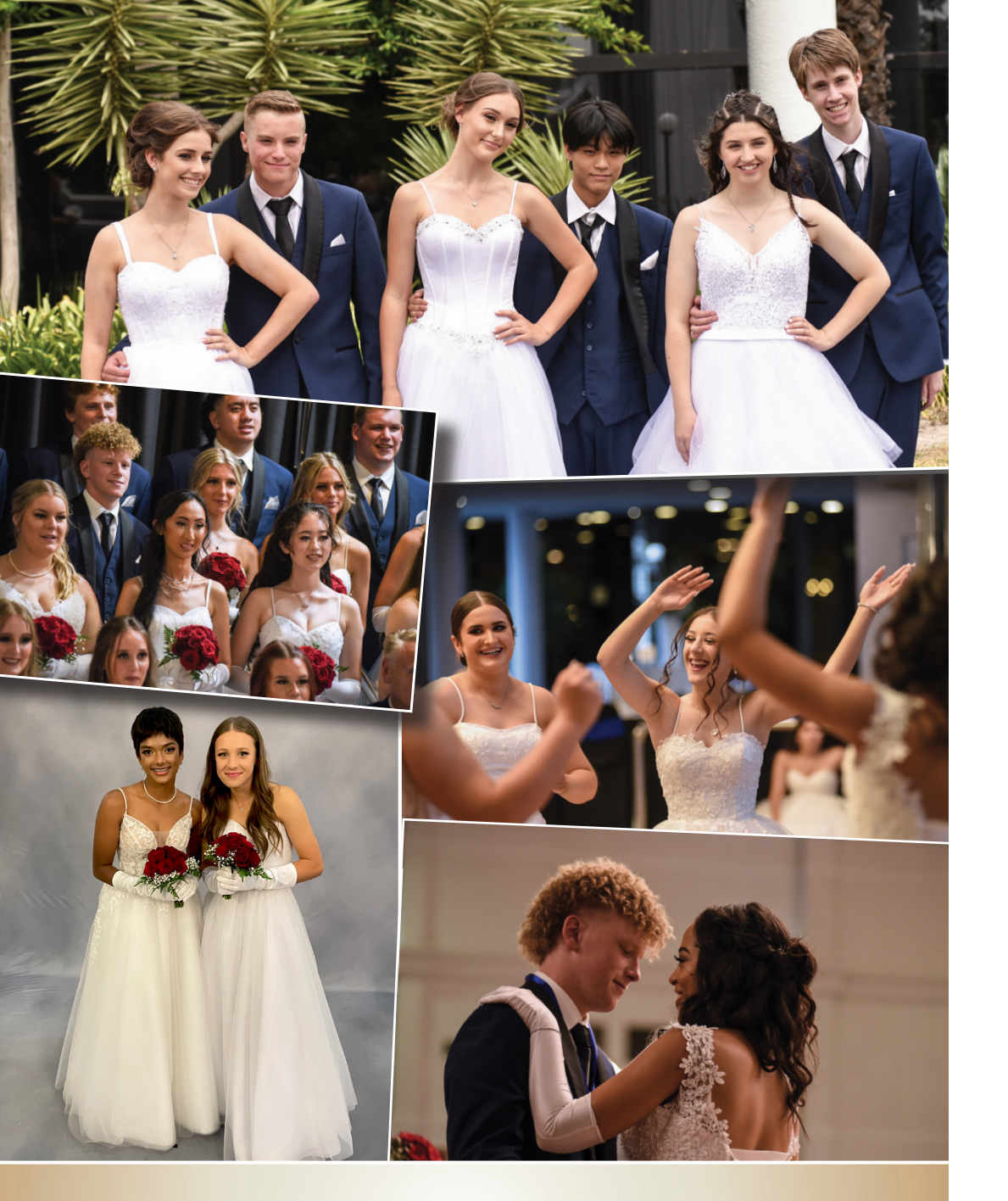
An Elegant Affair takes pleasure in co-ordinating your Debutante Ball