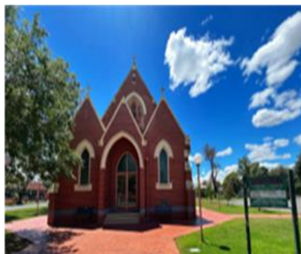
Sacred Heart, Yarrawonga Cnr Murphy & Witt Streets PO Box 36, Yarrawonga Vic 3730