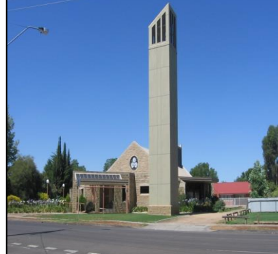
St Joseph's Cobram 6-8 William Street PO Box 424 Cobram, Vic 3644