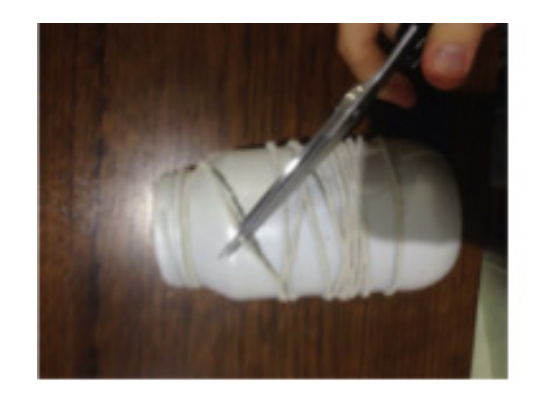
Step 4: Once the jar is dry carefully cut off a bit of the yarn and start to unwrap it. You can then put one of your candles inside the jar and light it.