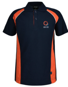
1115074 S/S Panelled Raglan Polo