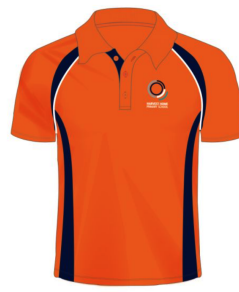
1111841 S/S Mesh Panelled Raglan Polo (Year 6 ONLY)