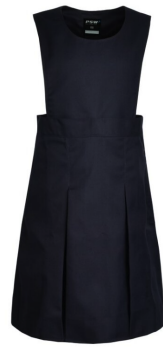
1104002 Box Pleat Tunic