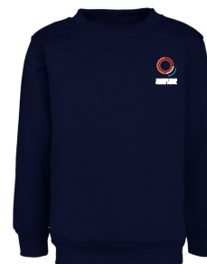
1100290 Crew Neck Windcheater