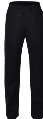
1110465 Classic Pant