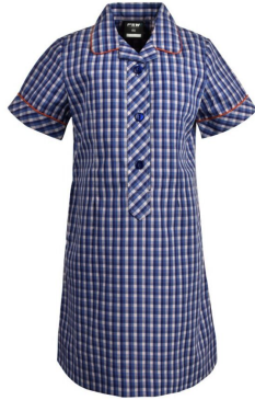
1100551 Summer Dress with Piping