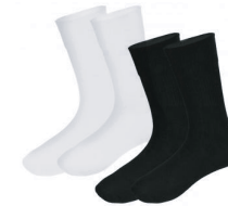
2511050 Crew Socks - 3 pack