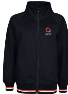
1110736 Zip Jacket - Stripe Rib