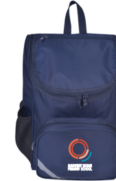
8362200 Explorer Bag with Laptop Insert