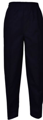
1110400 Elastic Waist Pants - Yoke Back