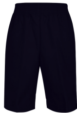
1110355 Gaberdine Zip Pocket Shorts