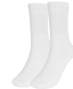
1110760 Cushion Foot Sport Socks - 3 Pack