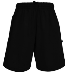
1160330 Rugby Shorts