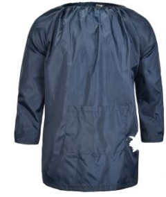
1160380 Artsmock with Print