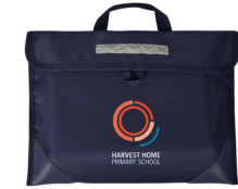
8360396 Scholar Bookbag