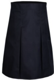
1104001 Box Pleat Skirt