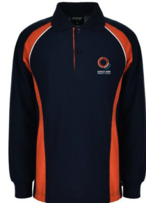
1111827 L/S Panelled Raglan Polo