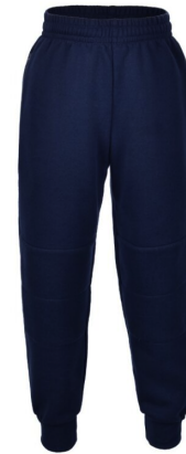
1110423 Trackpants - Double Knee - Rib Cuff