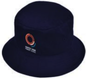
1100525 Bucket Hat