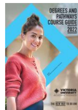
VU UG course guide 2022