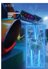
Monash UG Course Guide 2022