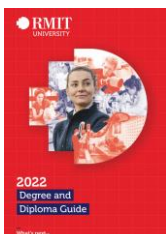
RMIT UG Course Guide 2022