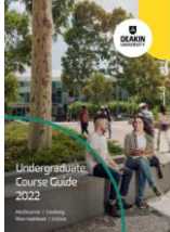
Deakin UG course guide 2022