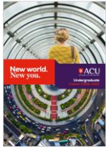
ACU UG Course Guide 2022