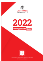
LaTrobe UG course guide 2022