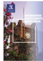
UniMelb Info for students 2022