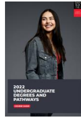
Swin UG Course Guide 2022