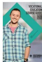
VU voc ed course guide 2022