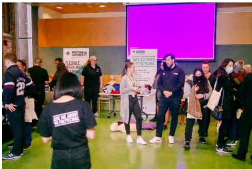
Above: Images from the What's Nexpo? Event held at Visy Cares Hub on 20 May