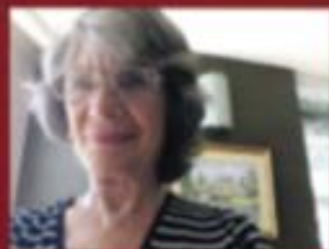
Sir Gustav Nossal Fine Art Awards Elizabeth Rosanove Fine Water Color Awards