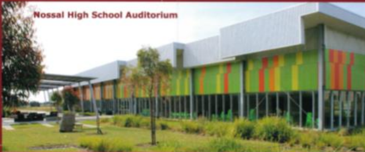
Nossal High School Auditorium