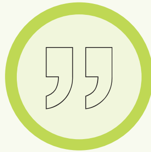
Conventions of language (spelling, grammar and punctuation)