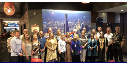
The Lions Club of Taylors Lakes (and friends)!

After 2 years of cancellations and disappointments, we are feeling more confident of a year where we can resume "normal" activity and make a broader difference for our community.