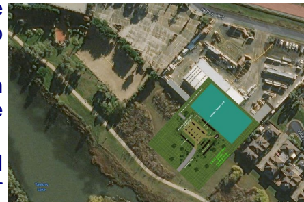
The Community Garden will be placed on land immediately behind BOWENS TIMBER.

Out of interest, here is the proposed siting (not to scale). If you're familiar with the Linear Park, you might be able to visualise it.