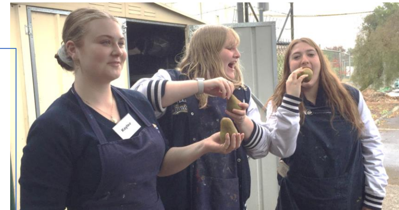
Enjoying fresh organic pairs from the GCH orchard