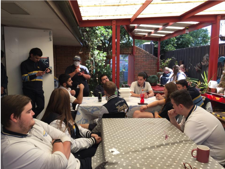
The gang this year