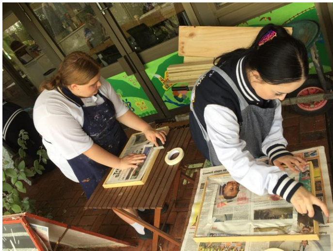
Art/Maintenance sealing timber frames around hand painted tile displays