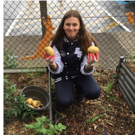
Weeders/Seeders preparing beds & harvesting potatoes; 107!