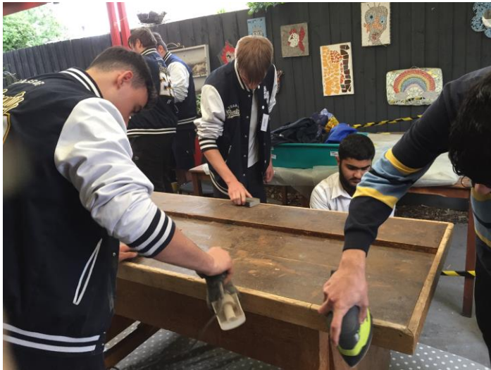
OHS crew & Diggers/Earth movers sanding & sealing woodwork benches