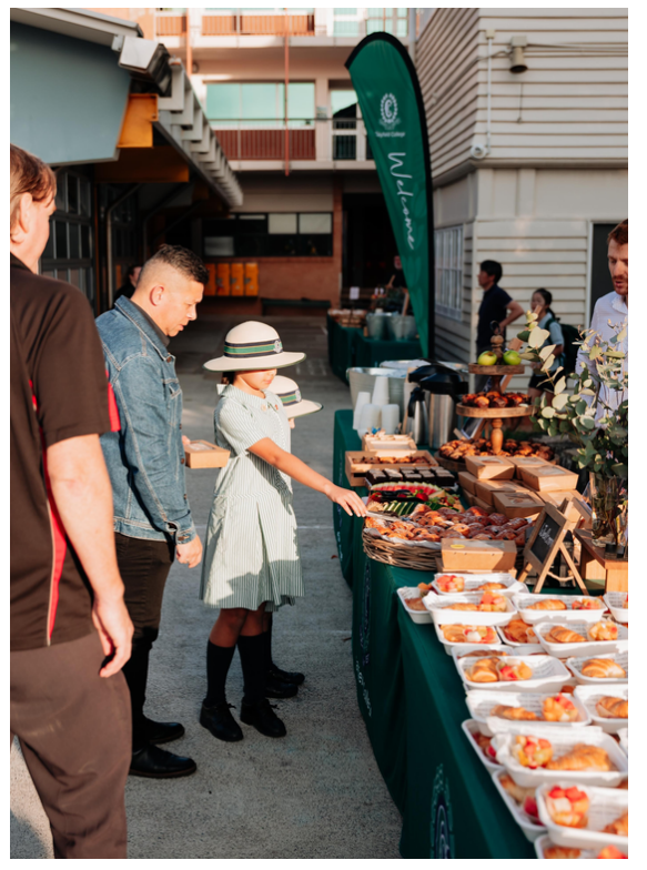
Festival of Fathers' Breakfast 2024