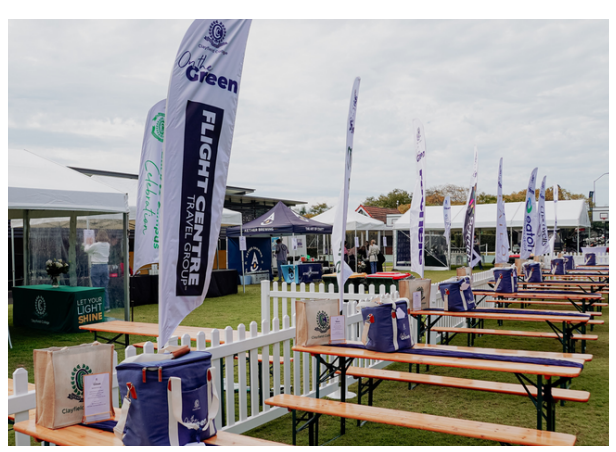
Dedicated Sponsor Area and Merchandise Packs at On the Green 2024