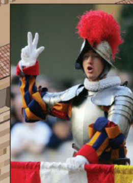
A Swiss Guard stands watch outside the door facing the Sala Regia.