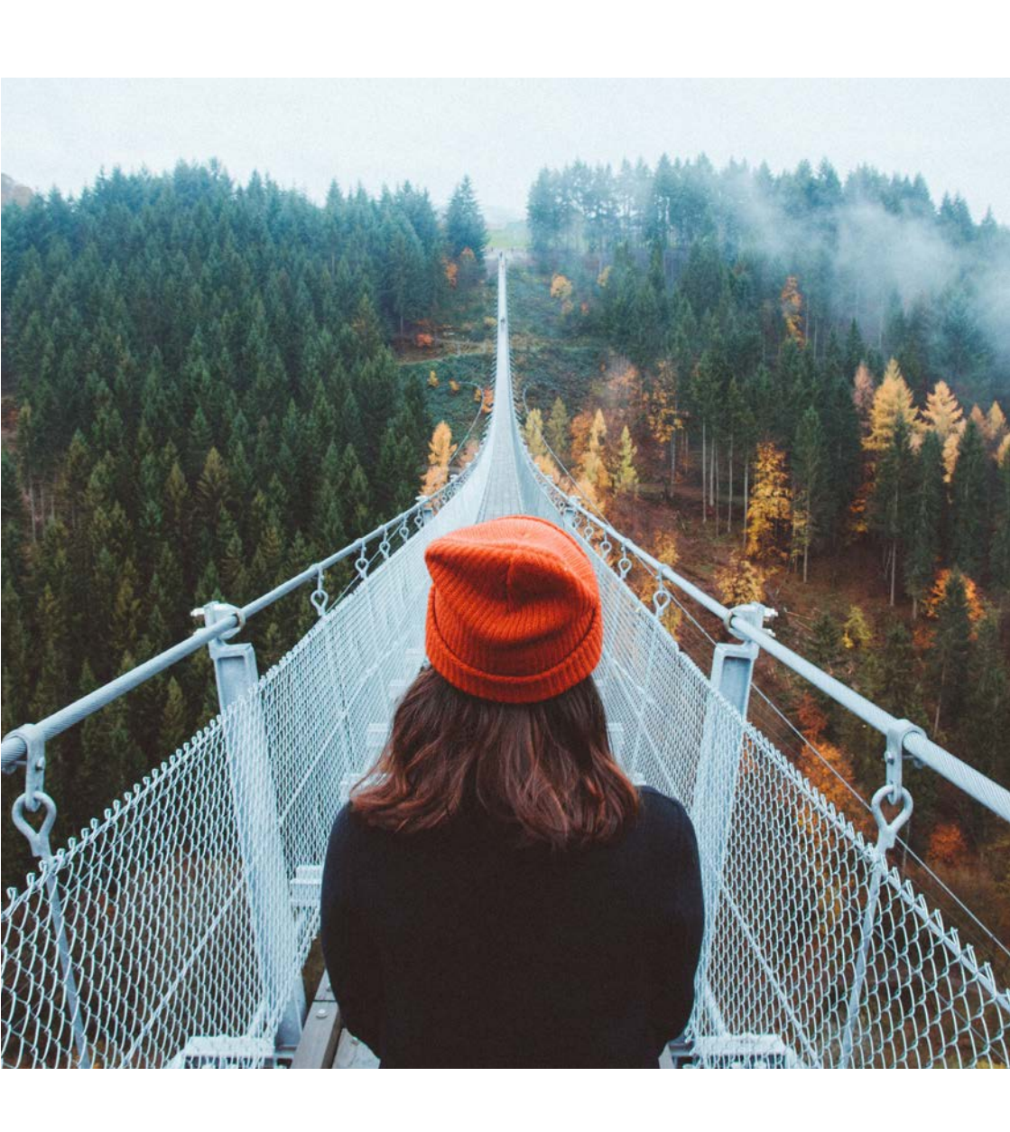
GOING FORWARD TOGETHER ... Fifth Sunday of Lent 2022