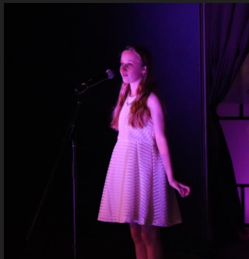
Vocal soloist 'Be Brave Variety Show' (2019)