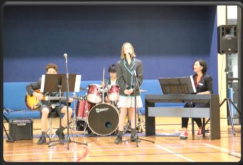
'Presentation Night' Band performance 2019

Instrumental music students participate in bands & small ensembles with various instrument combinations!