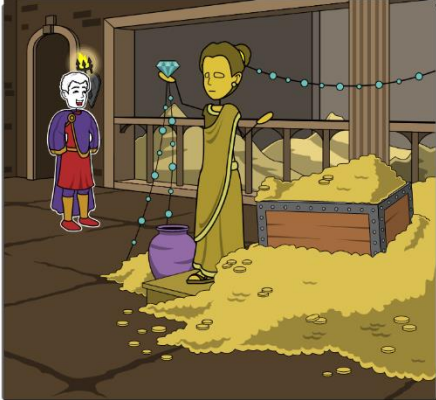
The Arrogant Prince

There was once a prince who was not liked the the people of his land. They only saw him as rich and arrogant.