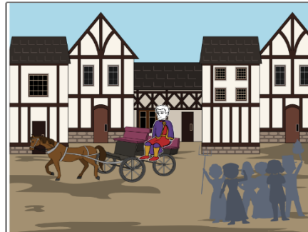
The prince arrives at the village.

After a long journey through the dense forest the prince arrived to the village but the protesters were still chasing him.