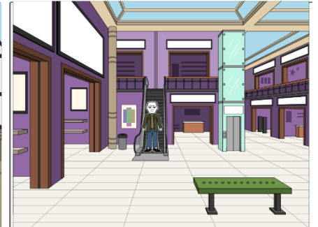
The prince looks normal.

The prince left the safety of his carriage and ran towards the market. he was able to loose the protesters and he found some clothes that made him look normal.