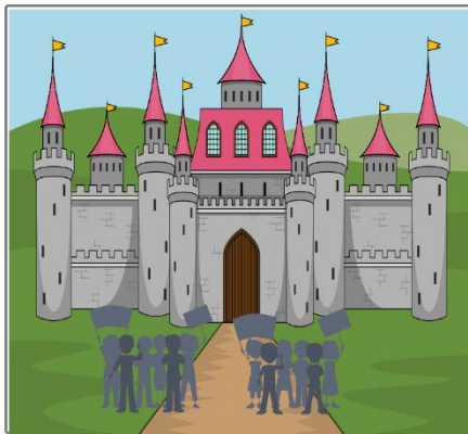
Protests Against The Prince

The people would protest outside the castle he lived in. They didn't want him as a prince anymore.