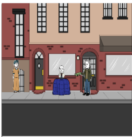
The prince is welcomed back the his kingdom