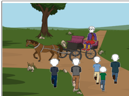
The Prince is chased.

When the prince was trying to escape the castle he was spotted by some of the protesters and they began chase.