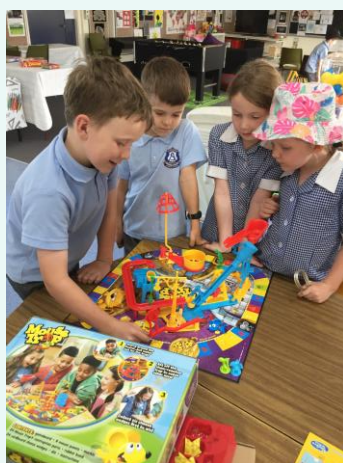
Indoor games .