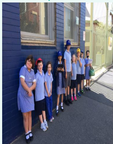
ASC Evacuation Drill