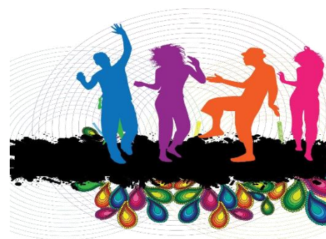
Dance club OSHClub style!

We would also like to congratulate all the children who were nominated to represent our beautiful school and community. We are sure you will all bring something special to our school. We hope you all have a wonderful week.