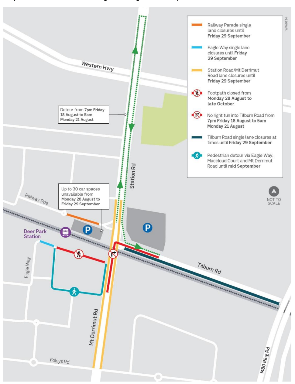
Map 1. Deer Park travel changes in August and September