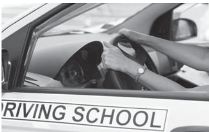
SAFE DRIVING LESSONS