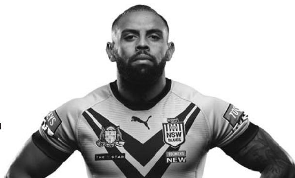
Josh Ado Carr