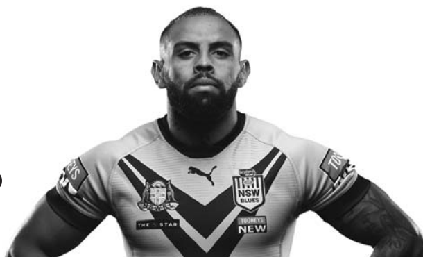
Josh Ado Carr