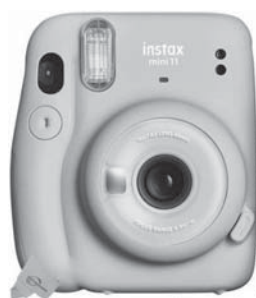
FUJI INSTAX CAMERA