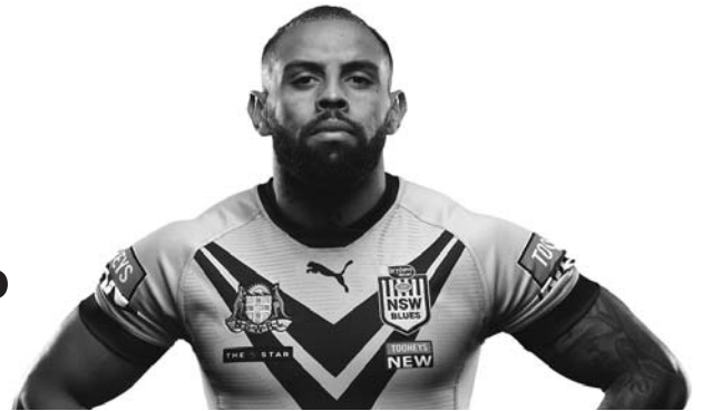
Josh Ado Carr