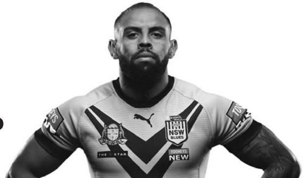
Josh Ado Carr