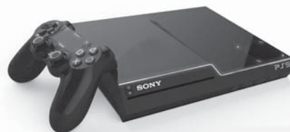
PLAYSTATION 5 CONSOLE