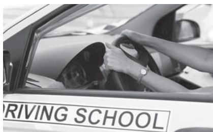
SAFE DRIVING LESSONS