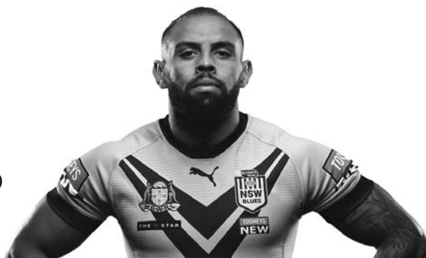
Josh Ado Carr