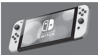
NINTENDO SWITCH CONSOLE