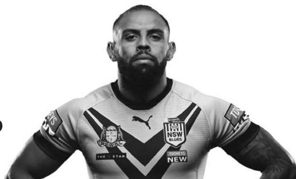
Josh Ado Carr