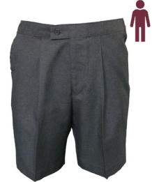
Shorts Senior Pleat Front