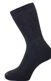
Grey Crew Sock 3pkt

For current prices, please refer to www.bobstewart.com.au