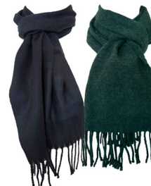
Scarf Navy or Green

For current prices, please refer to www.bobstewart.com.au