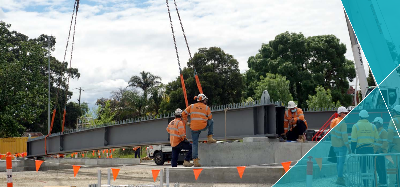
The steel bridge beams being delivered to site