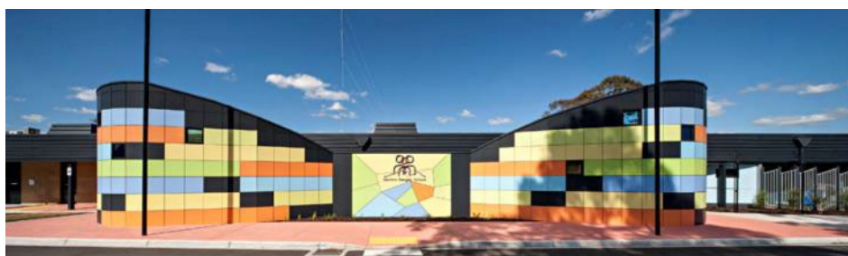
Eastern Ranges School