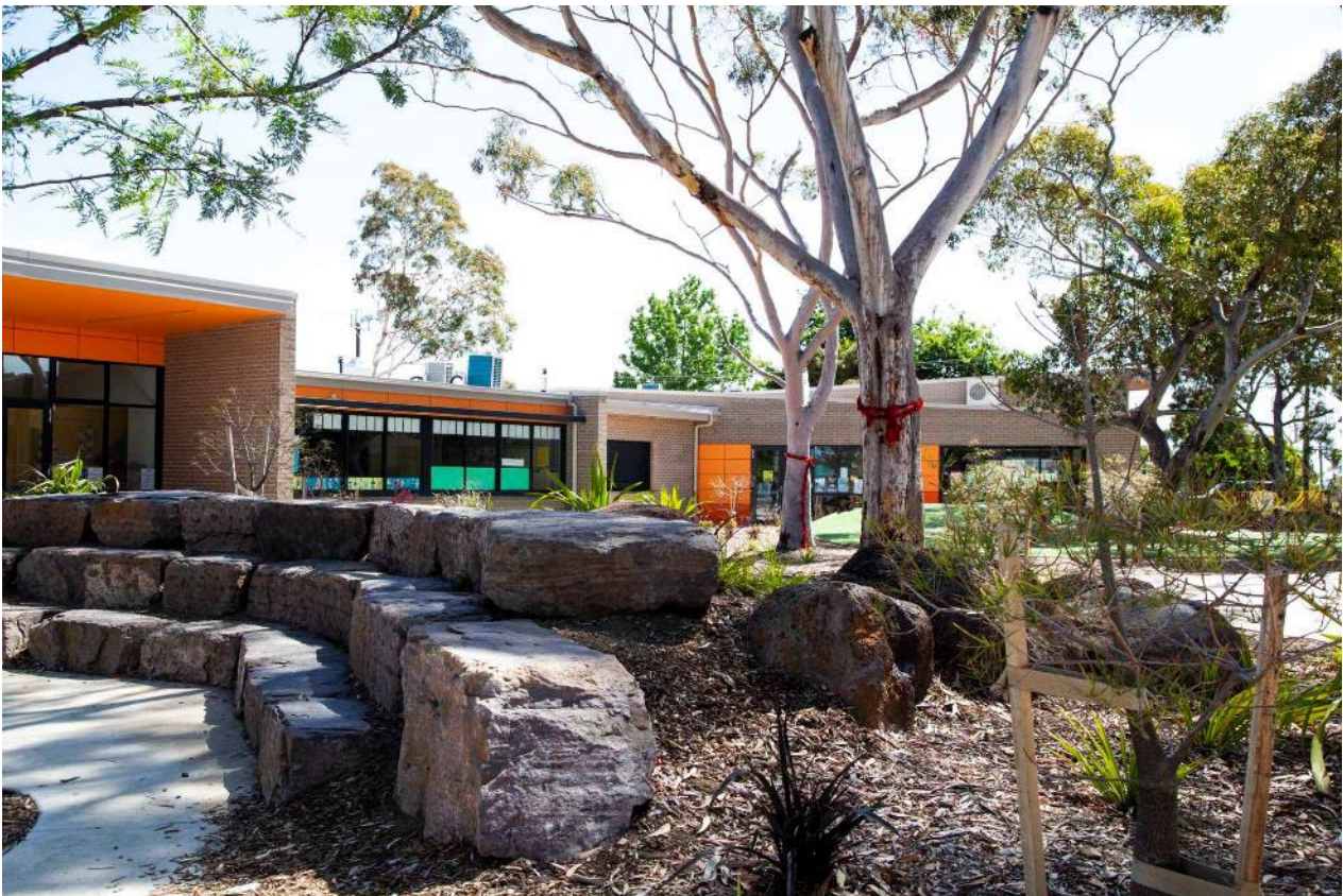
Bimbadeen Heights Primary School.

Bimbadeen Heights Primary School has taken a meaningful step towards deepening its connection to First Nations culture by creating a new Acknowledgement of Country video. This inspiring initiative showcases the school's commitment to honouring the Traditional Owners of the land and fostering respect for Indigenous heritage.