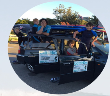
PICK UP AND DROP OFF

CatchEm Action is a personalised surf facilitation service that provides all the necessary ingredients for kids to pursue their passion for surfing as a co-curricular sporting activity before, after or during school.