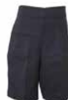
Shorts Pull On