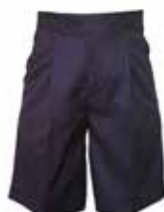
Shorts Elastic waist