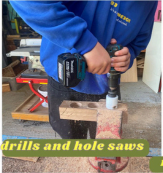
drills and hole saws