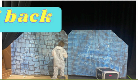
scenic painting for the school production