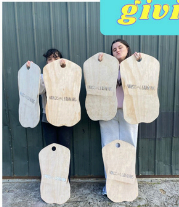
creating forms for the FHS Aerobics Team to use for costume making