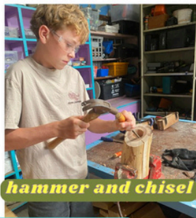
hammer and chisel