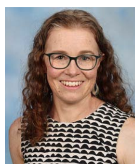
LUCY 8J1, 8J2, 8J3 8J4