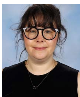
MERCEDES Head of Sub-School