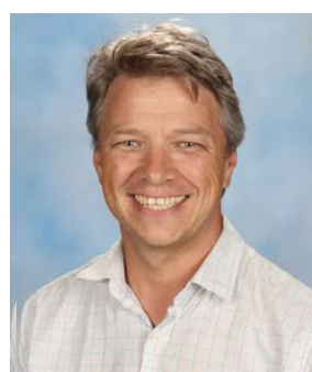
CONRAD 12G1, 12G2, 12G3 12J1