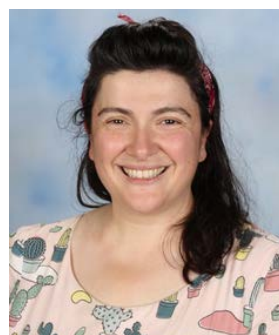
LISA 7T1, 7T2, 7T3, 7C2