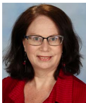
ROBYN 7J1, 7J2, 7J3 7J4, 7C3