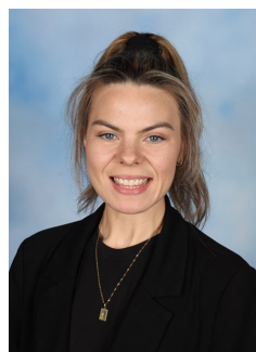
SHERIDAN 7G3 7C1 7G1, 7G2,