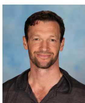
YOXFORD 8C1, 8C2, 8C3 8G2, 8G3