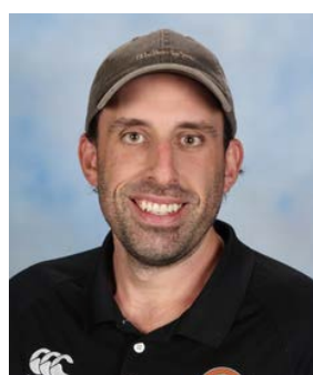
JACK 12T1, 12T2, 12T3 12J2, 12J3