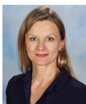
REGINA 11J1, 11J2, 11J3 11T2, 11T3