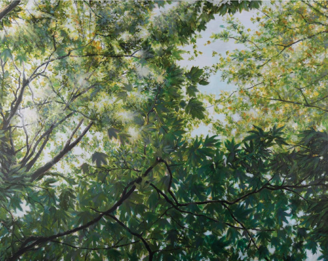
this page “Canopy” Yingzi Billy Wu Y6