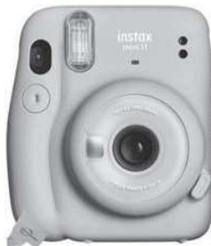
FUJI INSTAX CAMERA