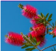
Kings Park Special Callistemon citrinus

A compact tree with creamy-white blossoms attracting honey-eating birds and butterflies. Grows 4 to 10 metres tall.