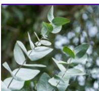
White Leaved Mallee Eucalyptus albida

A fast-growing tree with sweetly perfumed white flowers which provide food for butterflies including the Eltham Copper Butterfly. Grows up to 12 metres tall.