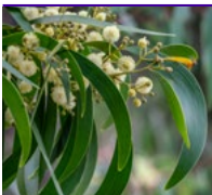
Lightwood Wattle Acacia implexa

A fast-growing bottlebrush with bright red flowers that attract bees, butterflies and nectar feeding birds. This small tree/large shrub grows 3 to 4 metres tall and is ideal for privacy screening.