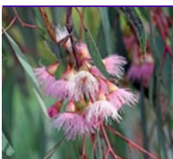
Red Flowering Ironbark Eucalyptus sideroxylon 'Rosea'

A unique tree with grey-green oval-shaped leaves and blossoms with small white flowers. Can tolerate very dry conditions. Grows 10 to 25 metres tall.