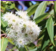
Honey Pots Gum Eucalyptus wimmerensis

A medium sized tree with blue-grey bark and creamy white-yellow flowers. Grows to around 8 metres tall.