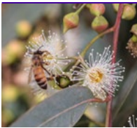
Dwarf Sugar Gum Eucalyptus cladocalyx nana

Choose up to two free native trees ideal for growing in Melbourne gardens.