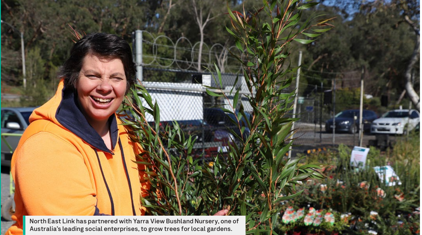
North East Link has partnered with Yarra View Bushland Nursery, one of Australia's leading social enterprises, to grow trees for local gardens.