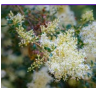
Sweet Bursaria Bursaria spinosa

Produces pink or red flowers and creates great habitat for native birds including the Swift Parrot. Grows 10 to 20 metres tall.