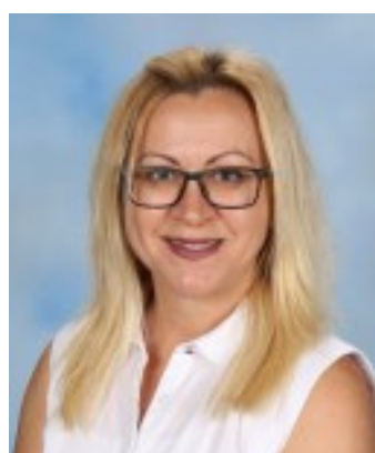
DEMI 11J1, 11J2, 11J3, 11T3