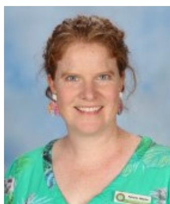
FELICITY 11T4, 11G4, 11J4, 12T1