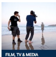
FILM, TV & MEDIA