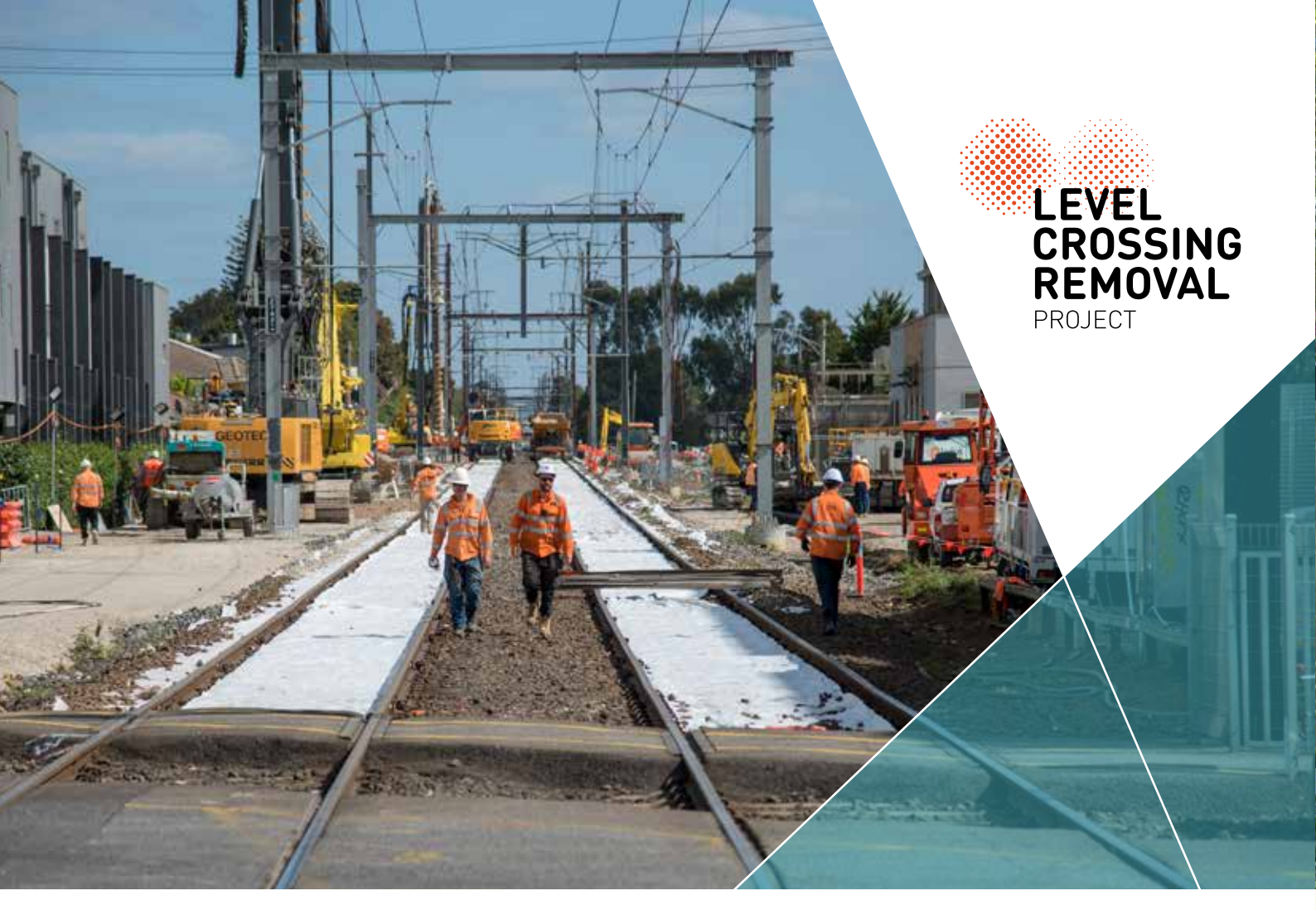
Major works continue in 2020 in Cheltenham and Mentone