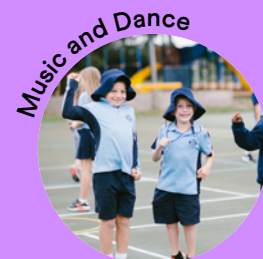
Music and Dance

In any one week, children could be participating in science experiments, active play, creative expression and more - we believe in learning through experience so that each child can grow into who they want to be.