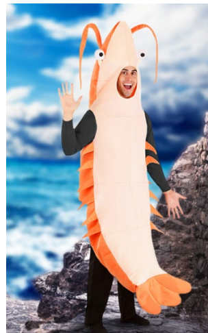
Costumes - Instructables