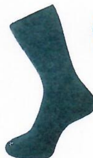
Sock Crew Navy 2pk