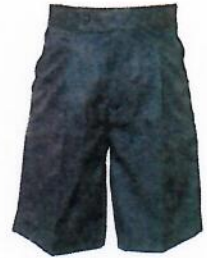
Shorts Fly Front