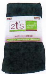
Tights Cotton Navy