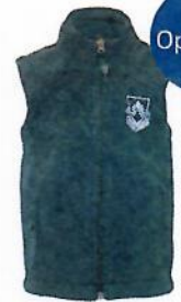
Polar Fleece Vest