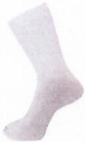
Sock Anklet 2 pkt