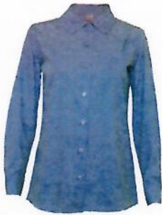
Peter Pan Blouse Lng Slv