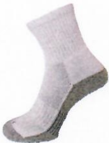
Sport Sock 2 pkt

For current prices, please refer to www.bobstewart.com.au