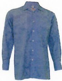
Shirt Open Neck Lng Slv