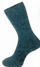
Sock Crew Navy 2pk

For current prices, please refer to www.bobstewart.com.au