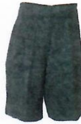
Shorts Elastic Back