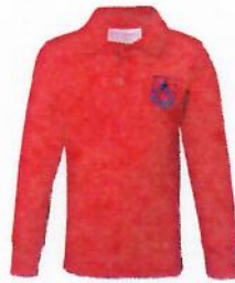
Sports Polo L/S