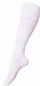
Knee High 2 pkt