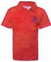
Sports Polo S/S