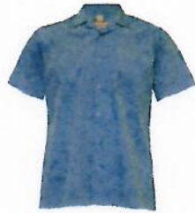
Shirt Short Sleeve