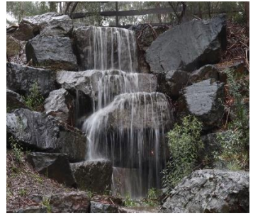
Waterfall after rain