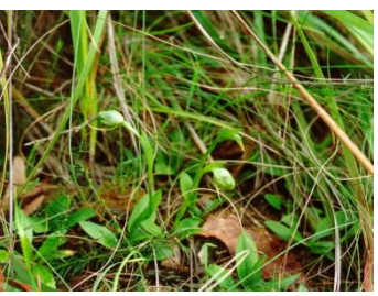
Nodding greenhood orchids

Sunday 2 July Working bee 9.00 am to 11.00 am Tuesday 18 July Monthly Bird Survey with Frank Gallagher 9.00 am Tuesday 25 July Waterwatch 8.00 am