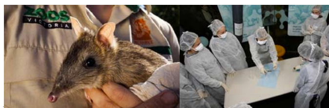
11. RMIT Flight Training Open Day, Point Cook, RMIT, http://bit.ly/2bPdU7o