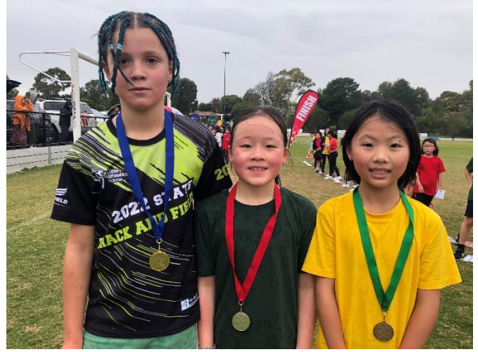
Girls 8/9/10 year olds