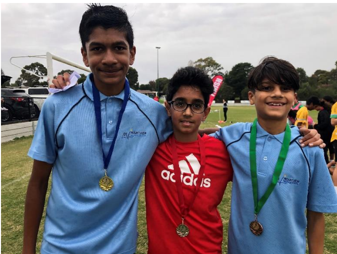
Boys 12/13 year olds