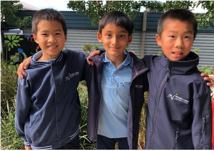
Boys 8/9/10 year olds