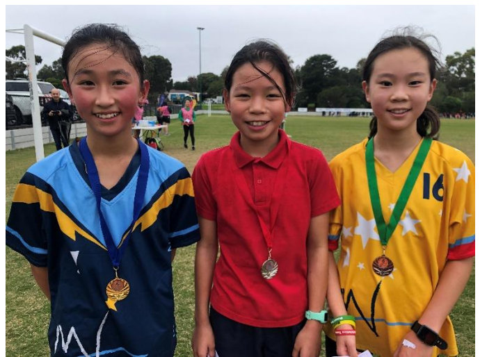
Girls 11 year olds