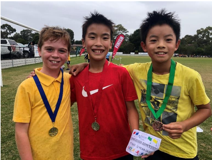
Boys 11 year olds