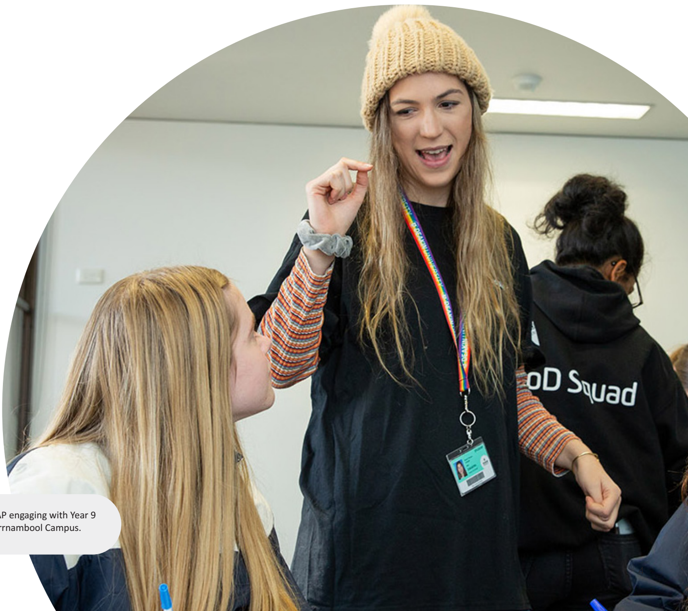
Mentor of DEAP engaging with Year 9 student at Warrnambool Campus.