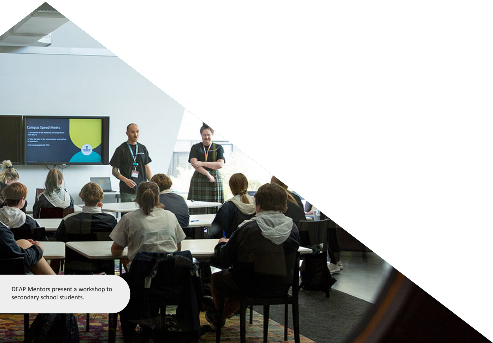
DEAP Mentors present a workshop to secondary school students.

For more information about the engagement of industry and community volunteers in our program, see Year 9, FutureME workshop (Page 10).