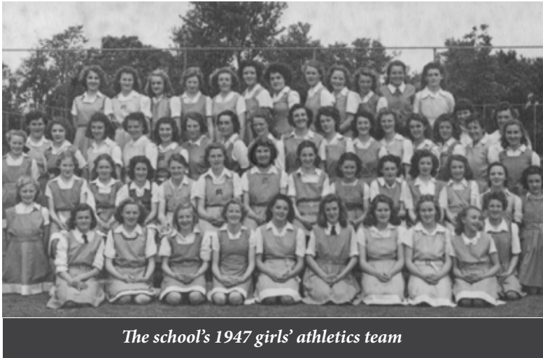
The school's 1947 girls' athletics team