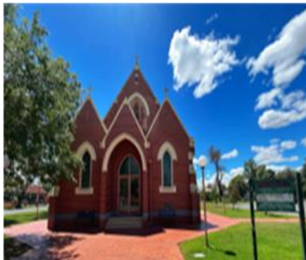
Sacred Heart, Yarrawonga Cnr Murphy & Witt Streets PO Box 36, Yarrawonga Vic 3730