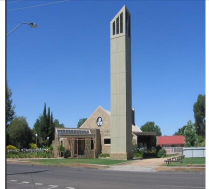
St Joseph's Cobram 6-8 William Street PO Box 424 Cobram, Vic 3644